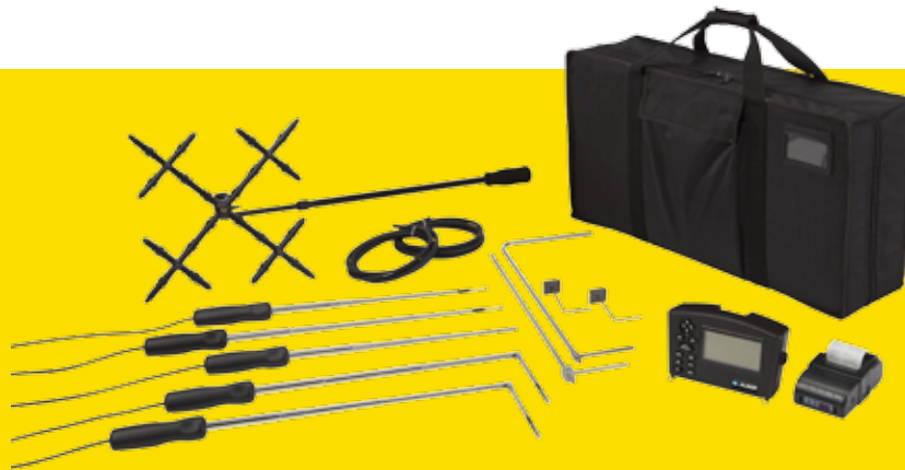
Model EBT730 (Micromanometer shown with standard and optional accessories)

As standard, the EBT731 Balometer Capture Hood includes a detachable EBT730 micromanometer – one of the most advanced, versatile, and easy to use micromanometers on the market today. The EBT730 features an auto-zeroing pressure sensor that increases measurement resolution and accuracy as well as integrates an intuitive menu structure to facilitate simple operation.