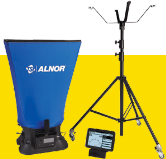
Model EBT731-STA Bundle shown.

The EBT731 Balometer™ Capture Hood is a multipurpose electronic air balancing instrument used for taking accurate, direct air volume measurements at diffusers and grilles. The corresponding detachable micromanometer can be used with an array of optional probes to enable various measurement applications. Compatible with LogDat™ Mobile Remote Reader Software and capture hood stand, the EBT731 maximizes worker productivity and efficiency—saving you valuable time on the jobsite for ultimate profitability.